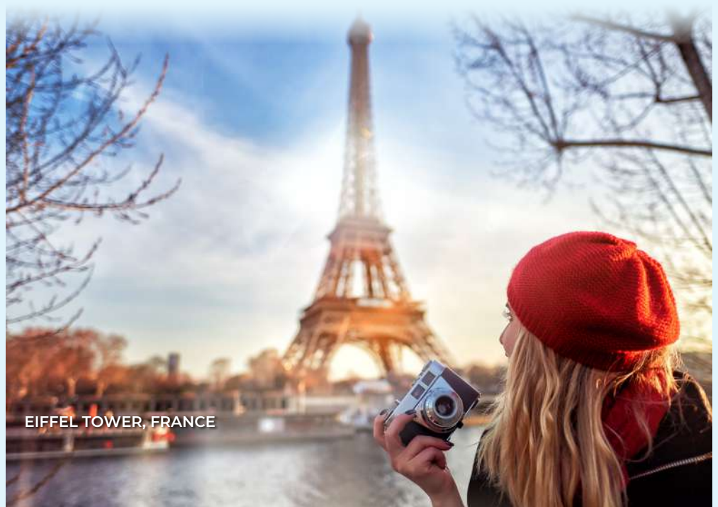
EIFFEL TOWER, FRANCE

* Note: Hotels subject to final confirmation. Should there be changes, customers will be offered similar accommodations as stated in this list.