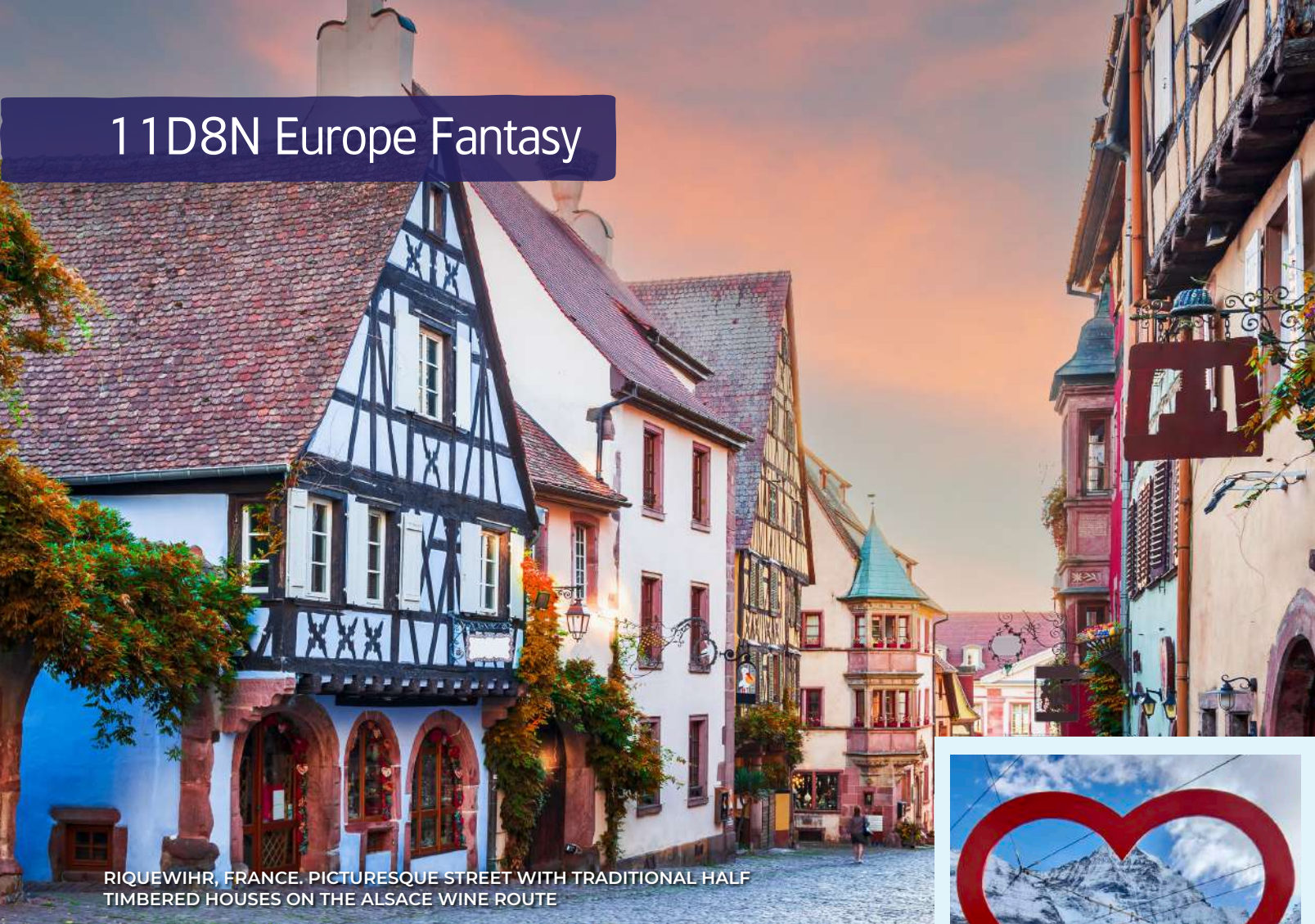
RIQUEWIHR, FRANCE. PICTURESQUE STREET WITH TRADITIONAL HALF-TIMBERED HOUSES ON THE ALSACE WINE ROUTE